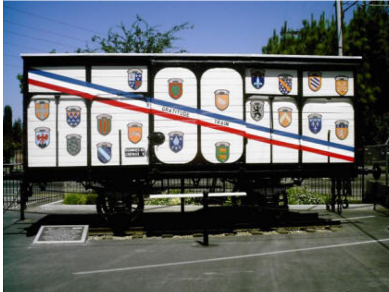
The "California Box Car"